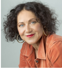
Rachel Berger Nora

Rachel Berger is one of Australia's favourite stand-up comedians guaranteed to deliver rapid-fire lines with assertive and acerbic virtuosity. She's a highly regarded and adaptive comedic performer working variously as a comedian, broadcaster, novelist, columnist, agitator and television entertainer. Rachel has taken four solo shows to the Edinburgh Festival and her dynamic presence and engagingly sharp observations have made her an extremely popular performer both live and on television, across Australia and internationally. Rachel's high public profile has done much to establish the position of women in comedy providing a distinctive voice for women's opinions and viewpoints. Following her acting debut in her successful one woman show Hold The Pickle , Rachel leaves the Stand Up microphone behind again to open another door to Dolls House 2 .